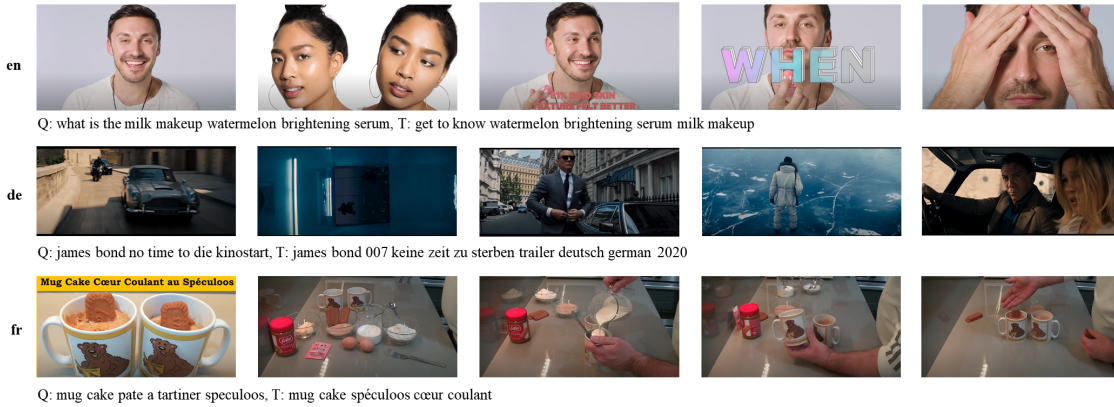
Figure 2: Examples in GEM-V dataset: Q: Query, T: Title.

For understanding tasks, multilingual masked language modeling, multimodal masked language modeling, masked region modeling and visual-linguistic matching are used as pre-training tasks to train a Transformer-based encoder. For generation tasks, multilingual denoising auto-encoding, image captioning and denoising image captioning are used as pre-training tasks to train a Transformer-based encoder-decoder. By training the encoder and the encoder-decoder with a multitask learning framework, universal representations are learned to map objects occurred in different modalities or expressed in different languages to vectors in a common semantic space.