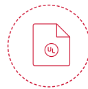
UL Solutions report