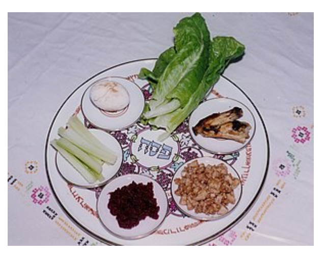
Photo of a <u>Passover Seder</u> Plate, which Yoninah contributed to Commons.